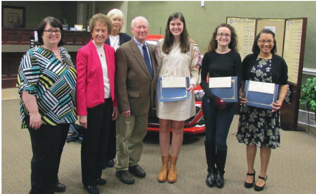
2019 Marshland Memorial Scholarship Recipients

All applications must be received by Marshland no later than February 19, 2020.